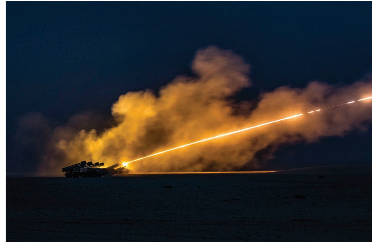
Photo above: U.S. and Kuwaiti soldiers fire mobile artillery rockets during a joint live-fire exercise near Camp Buehring in Kuwait, Jan. 8, 2019.

Since Operation Desert Storm in 1991, Kuwait has financially compensated the United States for maintaining forces on its soil. The Kuwaiti government, unlike most others in the region and around the world that are partnered with Washington, does not charge for the use of Kuwaiti land, and it offers the United States a very cheap rate for electricity and other utilities. Among other financial contributions to various U.S. military operations in the region, Kuwait has supplied the United States with approximately $200 million per year to help it contain and stabilize Iraq. And during and after Desert Storm, Kuwait paid the United States roughly $16 billion to offset U.S. war costs. Last but not least, Kuwait gave free plane rides to dozens of American evacuees from Afghanistan, sending them back home on Kuwaiti Boeing 777s.