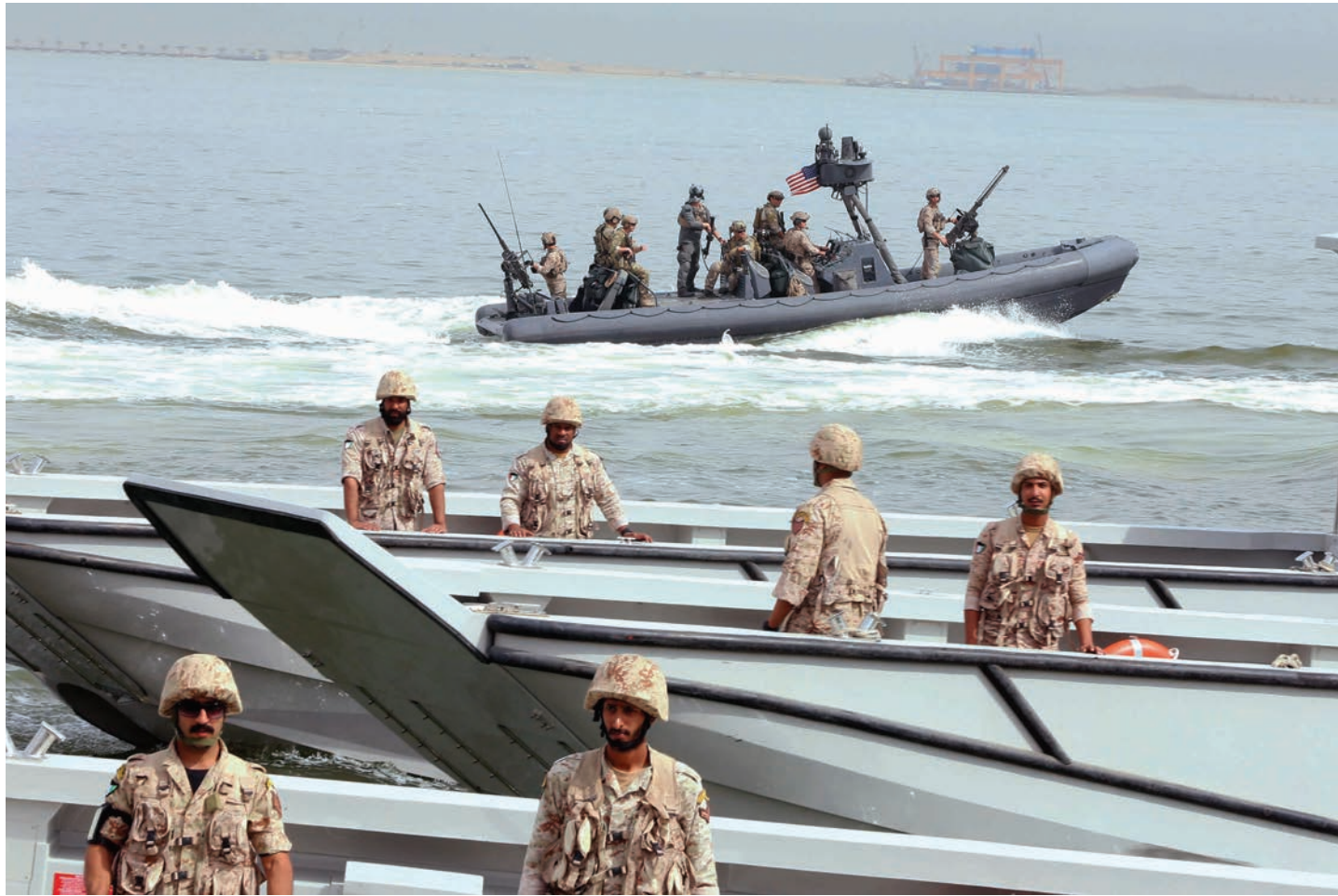
Photo above: Soldiers from the United States, Kuwait, and other Gulf Cooperation Council countries participate in the concluding drill of the wide-scale Eagle Resolve 2017 military exercise at Shuwaikh Port, west of Kuwait City on Apr. 6, 2017.

2021 joint chemical, biological, radiological, and nuclear decontamination training with U.S. Navy Explosive Ordnance Disposal technicians.