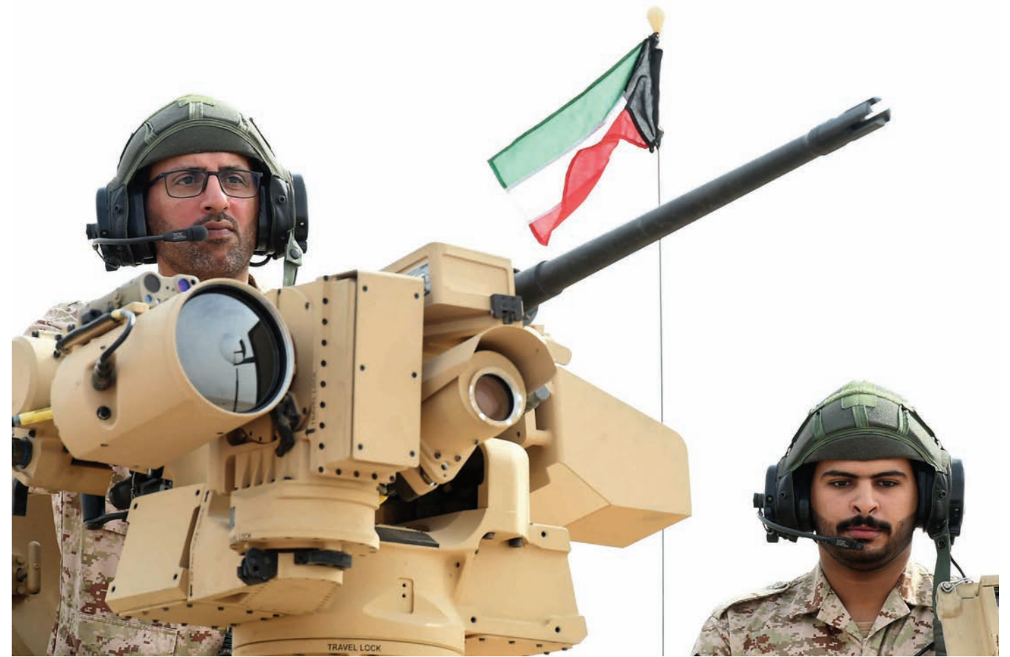
Photo above: Soldiers wait to participate in a military drill in Jahra Governorate, Kuwait, on Dec. 2, 2021.

Luckily for Washington, Kuwait is not one of those apprehensive or hesitant partners. Of course, this does not mean that the Kuwaitis have no issues at all with Washington or don’t ever question U.S. policy; but the trust they have in the United States is unmatched among Arab partners. Maybe it’s because the Kuwaitis recognize they don’t have better security options. Or maybe they’re eternally grateful to the Americans for liberating their country from Iraqi occupation. The reasons for this mutual, deep trust are less important. What matters most is that Kuwait is all in when it comes to the security partnership with the United States. This is quite important for Washington, and CENTCOM in particular, because contrary to conventional wisdom, Kuwait has a lot to offer, some of which is unique in the region.