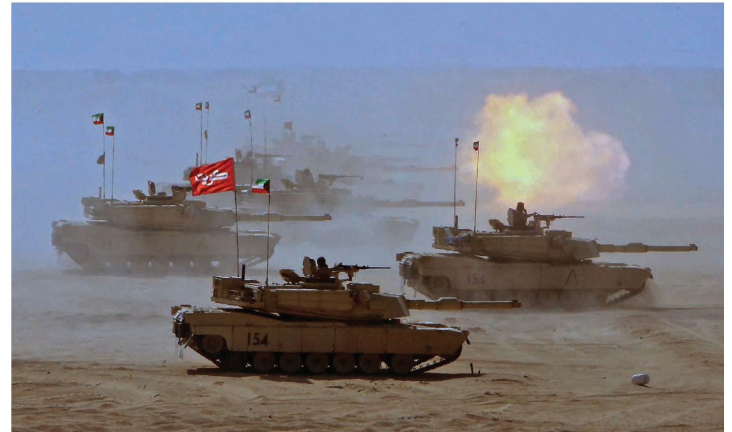
Photo above: Kuwaiti, Saudi, and U.S. land forces take part in the Gulf Gunnery 2021 exercise at the Udaira military range.

“During Operation Iraqi Freedom in 2003, Kuwait provided up to 60% of its territory for coalition use.”