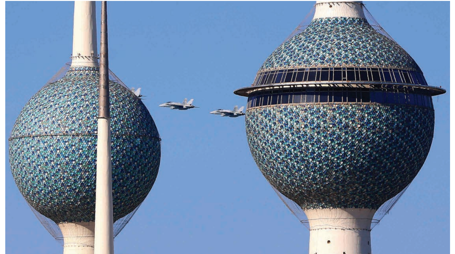
Photo above: Kuwaiti Air Force pilots show their skills near the Kuwait Towers, during the launching ceremony of the Hala shopping festival, in Kuwait City on Jan. 29, 2016.

The Kuwaitis have invested heavily with their own money in the Udairi Range Complex to provide premier training for their armed forces on ground maneuver and ground gunnery. In 2017, the Kuwaiti Parliament approved a $10 billion budget to fund defense modernization until 2026. In 2021, it increased the budget of the Kuwaiti Ministry of Defense by 37% in real terms .