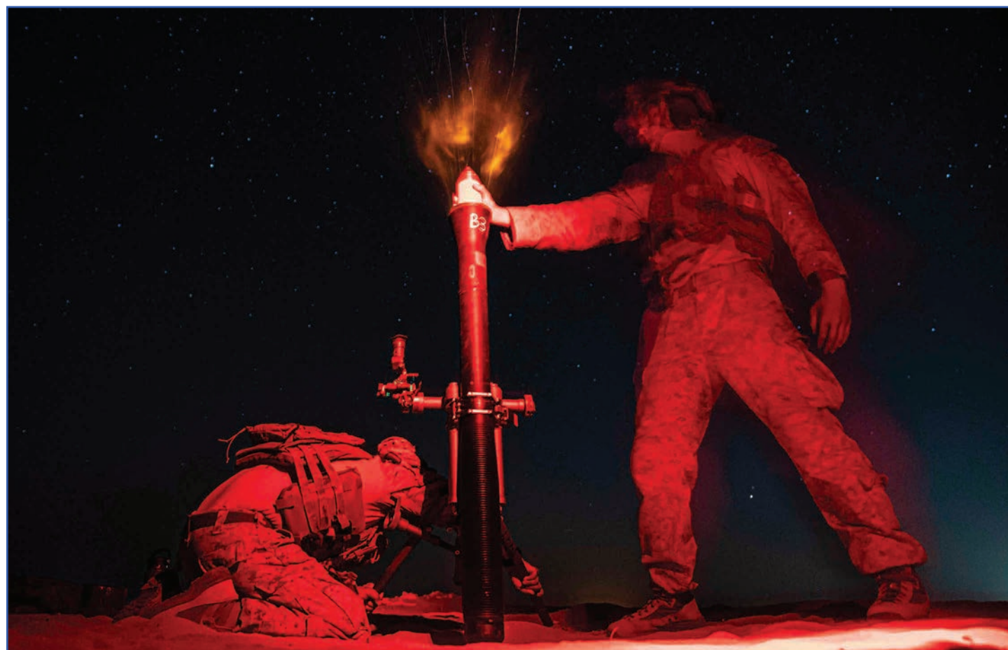
Photo above: U.S. Marines practice firing an M252A2 81 mm mortar system during a night live-fire exercise at Camp Buehring, Kuwait, Oct. 3, 2021.

Chaired by the crown prince and the prime minister, the Higher Defense Council is nominally responsible for defending the country. It addresses major matters of defense policy. Technically, the minister of defense, currently Sheikh Talal Khaled Al Ahmad Al Sabah, has a higher rank than all other civilian and military leaders of the Kuwaiti Armed Forces (KAF); but the KAF commander, Lt. Gen. Khaled Saleh Al Sabah, is the source of expertise on all things defense. Since his promotion in October 2020, he has almost always represented Kuwait