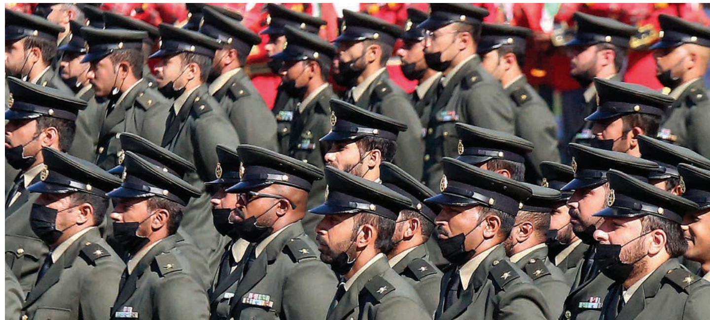
Photo above: Kuwaiti servicemen perform during a graduation ceremony for army officers, at Ali Al Sabah Military College in Kuwait City on Feb. 9, 2022.

While a couple of other Gulf Arab militaries have gradually moved to the Force Provider/Joint Warfighter model, Kuwait prepares for and organizes its defense largely like it did in 1990, before Iraqi forces invaded. Kuwait's current approach to steady-state operations leans almost exclusively on U.S. protection and involvement. In Phase Zero, this is not a sustainable approach for effectively and efficiently countering the increasingly complex security challenges and threats in the region.