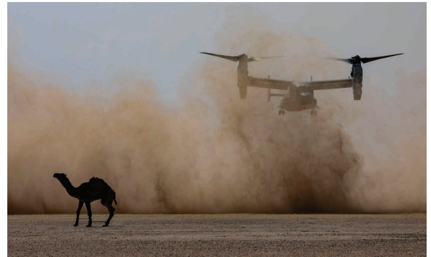
Photo above: A Marine Corps MV-22 Osprey prepares to land during embassy reinforcement training at Camp Buehring, Kuwait, Apr. 12, 2019.

We don’t need two divisions of tanks stationed in Kuwait, just like we don’t need a brigade combat team and two fighter squadrons in the country. The Kuwaitis have enough firepower of their own. What we need is tailored and more consistent U.S. advice on defense governance and, specifically, on how to create a Kuwaiti joint force.