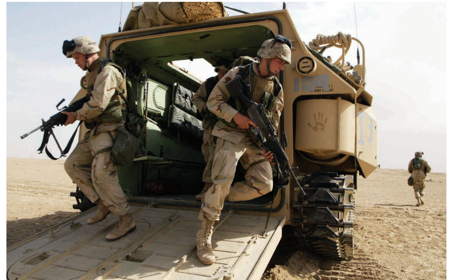
Photo above: U.S. Marines from the 1st Marine Division run out of an amphibious assault vehicle as they practice trench clearing on Feb. 15, 2003, near the Iraqi border in Kuwait.

Security cooperation between the United States and Kuwait is not limited to U.S. basing and the above-mentioned military activities and training exercises. Like other wealthy Gulf Arab nations, the Kuwaitis buy a healthy amount of weapons from the United States (though less than the Saudis or the Emiratis)