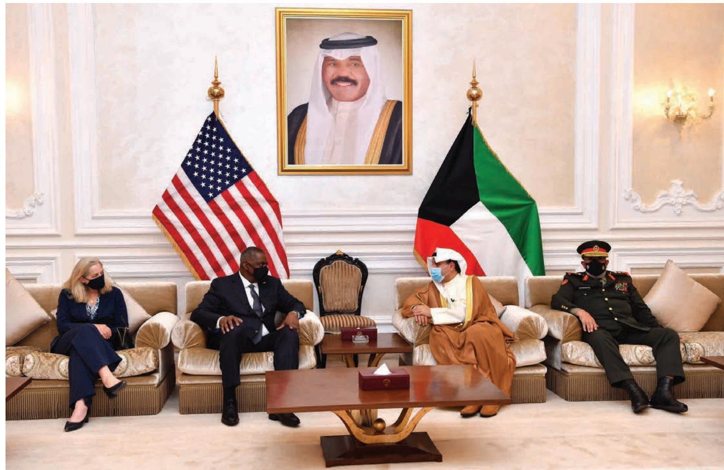
Photo above: U.S. Secretary of Defense Lloyd Austin (2nd L) meets Kuwaiti Deputy Prime Minister and Defense Minister Sheikh Hamad Jaber Al Sabah (2nd R) in Kuwait City on Sept. 8, 2021.

There’s very little joint training among the Kuwaiti services, even though there is a joint staff in the Ministry of Defense all working under KAF Commander Lt. Gen. Khaled Saleh Al Sabah, who is also the chief of the General Staff — meaning he doesn’t just have command responsibilities but also organize-train-and-equip responsibilities (he’s the equivalent of the U.S. Chairman of the Joint Chiefs of Staff). The Kuwaitis are currently seeking to build a Pentagon-like facility to group all their service headquarters in one place (they have been dispersed all this time), which is smart. If you want to be a joint force, at the very least you have to be in the same building. The Defense Security Cooperation Agency (DSCA) currently has an FMS case with Kuwait worth $1 billion to design and construct a new Kuwaiti Ministry of Defense Headquarters Complex that includes over 20 facilities for both civilian and military leadership.