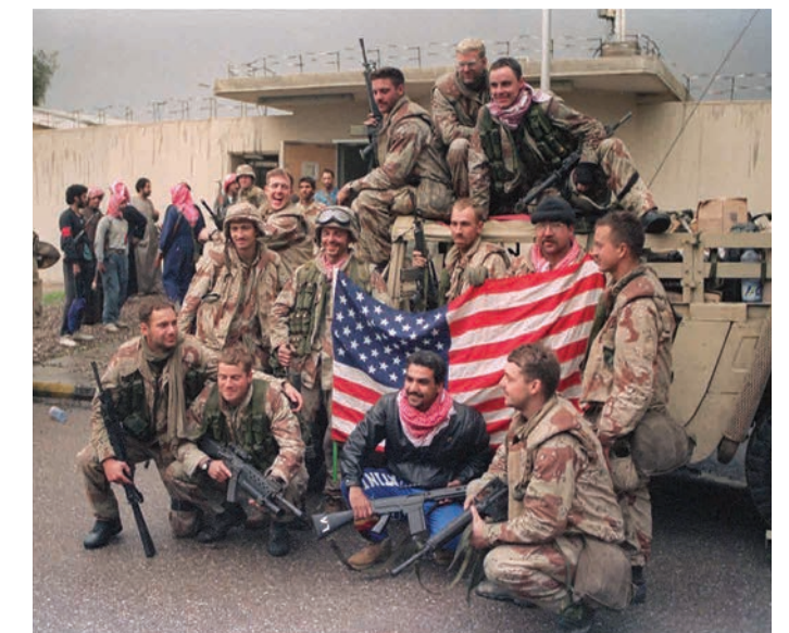
Photo above: Several members of the U.S. Special forces holding a U.S. flag celebrate their victory over the Iraqi army on Feb. 27, 1991, in Kuwait City.